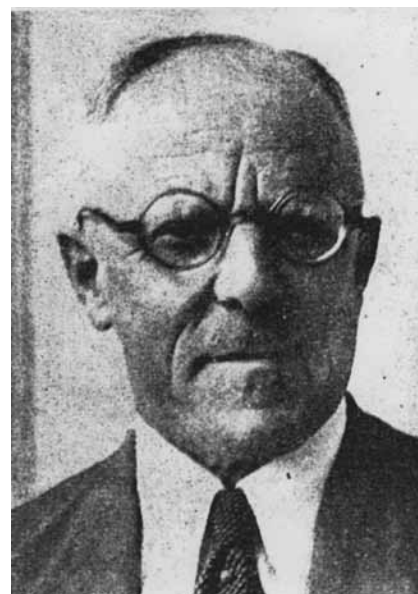
Figure 1 The outstanding German pathologist Siegfried Oberndorfer