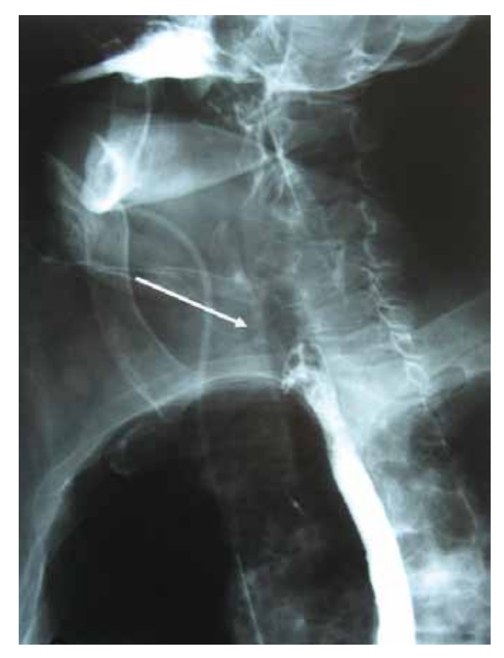
Figure 5 Esophagogram at day 12 confirmed the successful result