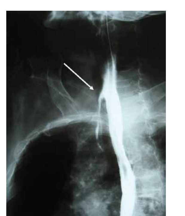
Figure 3 Esophagogram with gastrographin meal at day 5 revealed leakage from the upper esophagus

At this site and in contrast with the rest of the esophagus, the wall consists of only one muscle layer (circumferential). Thus, Lannier's triangle is known to be a vulnerable site prone to trauma and perforation during several medical procedures, including use of rigid instrument with head hyperextension for foreign body disimpaction, especially in case of pressure of the rigid scope over a cervical vertebra bone spike [3,15].