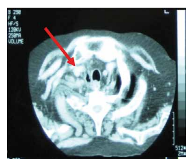
Figure 1 Esophageal rupture documented by cervical CT scan

The most common causes of esophageal perforation