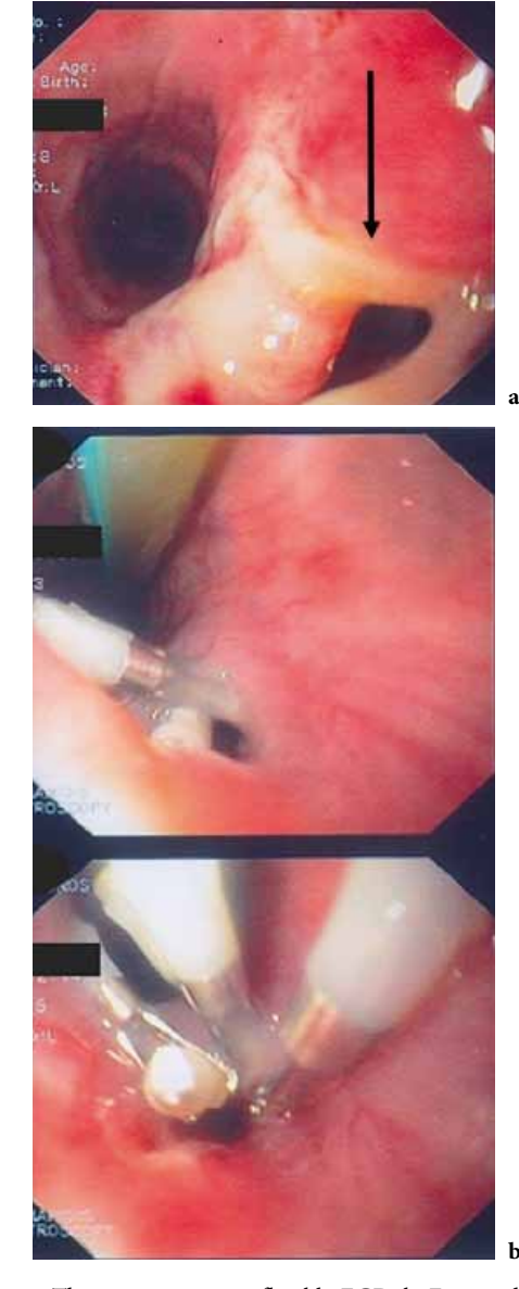
Figure 2 a. The rupture site via flexible EGD, b. First endoscopic intervention, with the use of endoclips

are iatrogenic-instrumentation (i.e. tracheal intubation, rigid laryngoscopy, EGD, EUS, bougie dilation, placement of nasogastric tube) (59%), spontaneous perforation or Boerhaave's syndrome (15%), foreign-body ingestion (12%), trauma (9%), operative injury (2%), tumor (1%) and other causes (2%) [1].