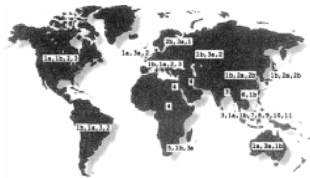
Figure 2. HCV genotyping assays and the genomic regions used for every assay.

serotyping method can determine the subtypes included in the genotypes.