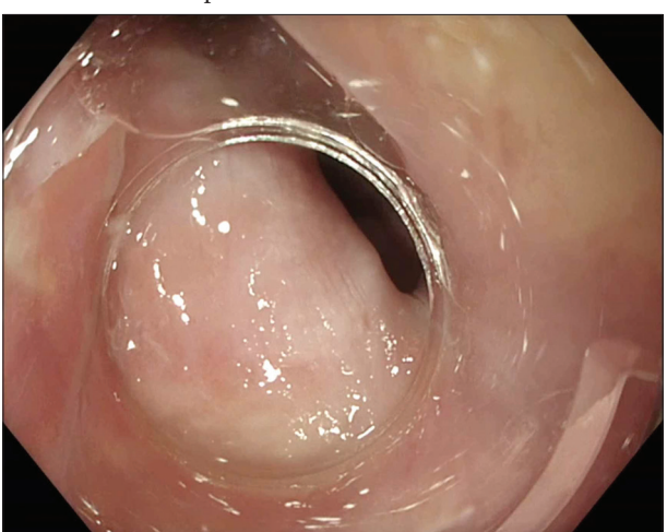
Figure 1 Endoscopic appearance of a prominent cricopharyngeal bar with high-definition white light endoscopy

The primary outcomes were technical success, clinical success, and rate of procedure-related adverse events. Technical