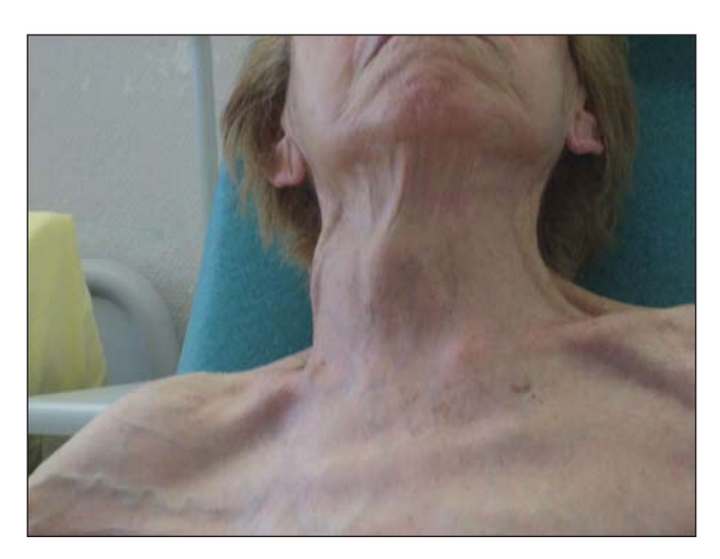
Figure 2. Collateral venous circulation involving both cervical and upper thoracic area

and portal vein to be normal in size, thus providing no evidence for portal hypertension. Workup for her goiter included a cervical and thoracic CT scan which showed a voluminous thyroid goiter (with an estimated volume of 525 cc³) filling the entire cervical area and extending into the upper mediastinum, causing oesophageal compression (Fig. 3, 4). As radioiodine therapy was proposed, we performed an ultrasound-guided thyroid biopsy which confirmed the non malignant nature of the goiter.