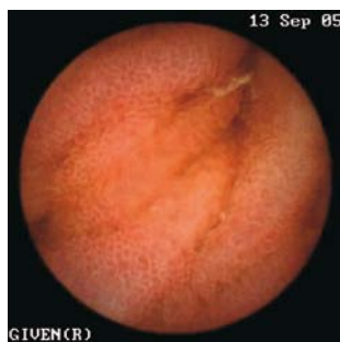
Fig. 5. Edematous appearance of intestinal mucosa in the whole length of SB of a RTR