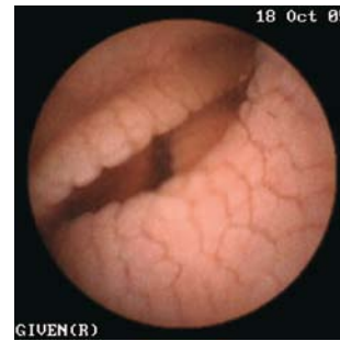
Fig. 7. Scalloping, as an endoscopic marker of villous atrophy, suggestive of celiac disease