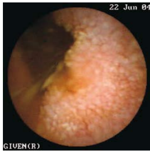
Fig. 3. Lymphangiectasia in the jejunum in a patient with laboratory findings compatible with protein-losing enteropathy