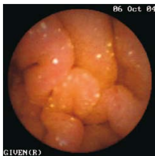
Fig. 4. White spots in the distal duodenum