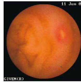
Fig. 1. Aphthoid ulcer in the jejunum compatible with MMF toxicity

Lymphangiectasia, in a pattern of continuous involvement was identified in 4/18 (22.2%) RTRs and in none of the controls. Endoscopically, lymphangiectasia was characterized by a large group of villi with whitened tips (Fig. 3). In 3 of them lesions involved only the jejunum while in