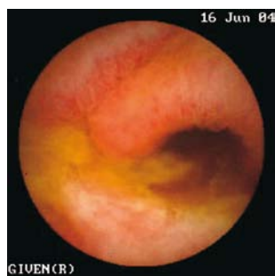
Fig. 6. Ulceration with cobblestoning and stricturing suggestive of Crohn's disease

Following CE, therapeutic measures were undertaken in 6/18 RTRs and in 2/26 controls. Pharmacotherapy was provided in the patient with CMV enterocolitis and in the one with Crohn's disease. The dose of MMF was decreased in RTRs with the MMF enteritis, resulting in cessation of diarrhea. A low-fat diet, enriched with medium-chain triglycerides was suggested to RTRs with lymphangiectasia and PLE. Clinical and laboratory improvement followed. In the patient with celiac disease, a gluten-free diet was suggested resulting in symptomatic improvement.