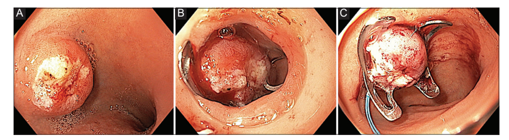
Figure 5 (A) Duodenal neuroendocrine tumor (NET) with surface ulceration. (B) Over-the-scope clip (OTSC) applied to the base of duodenal NET. (C) Endoloop applied below the OTSC to duodenal NET