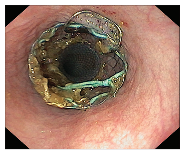
Figure 3 Fixing of esophageal self-expandable metallic stent with novel over-the-scope clip stent fixation system

OTSC was used in 8 patients with non-variceal upper GI bleeding as primary therapy (n=5) and rescue therapy (n=3). The etiologies and characteristics of patients with upper GI