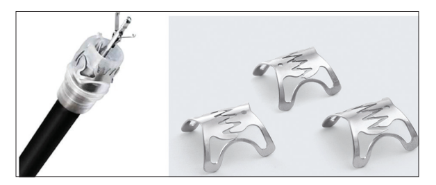
Figure 1 Over-the-scope clip device system with 3 different types of clips

The OTSC was mounted over the tip of the gastroscope and released by tightening the thread with the hand wheel. The use of a twin grasper or anchoring device to assist the closure of defects was left to the discretion of the endoscopist performing the procedure [10]. Three endoscopists with formal training in OTSC performed all the procedures.