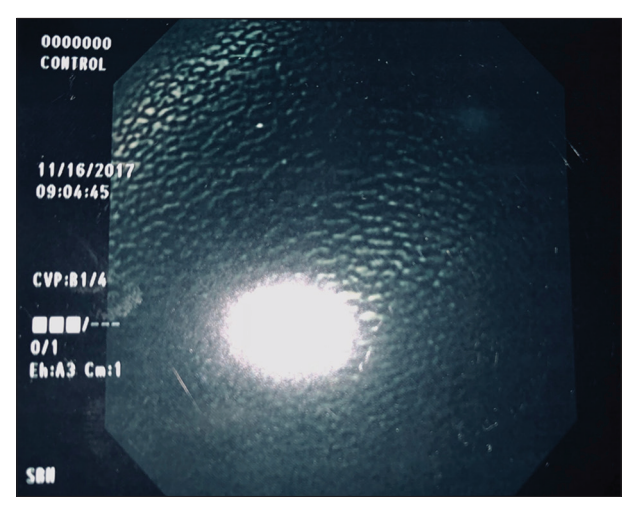
Figure 1 Control group colonoscopy camera display including (from left side, top to bottom): medical record number, date, time (for display purposes only)

The control group consisted of patients who underwent colonoscopy in 2015 without the visual cue on the endoscopy screen indicating withdrawal time. The study group consisted of patients who underwent colonoscopy in 2017, when visual cues indicating withdrawal times were implemented at our institution.