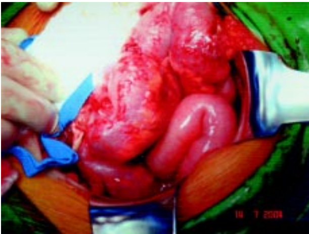
Fig. 1. Operative findings: Note the angulation of the loops of the small bowel with obvious the pathology of the enteric wall.