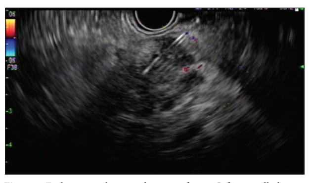
Figure 1 Endoscopic ultrasound image of a 19-G fine-needle biopsy needle used to obtain a core biopsy from a solid pancreatic head mass