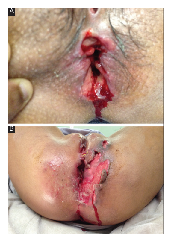
Figure 1 (A and B) small and massive anal ulceration in patients with perianal Crohn's disease

Anal ulceration is thought to be common in the context of PCD (Fig. 1A,B). A retrospective review by Bouguen et al [19] reported that 94 of 99 patients with non-fistulizing PCD treated with infliximab infusions had ulceration. Siproudhis et al [17] report a prevalence of 67% (43/64) in consecutive CD patients with anal lesions referred to a tertiary institution. Other studies have reported lower rates [8,20], perhaps reflecting case mix or