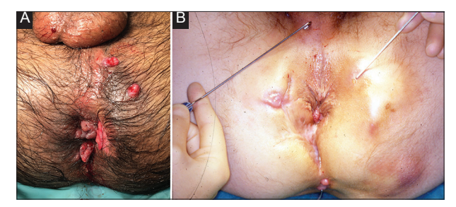
Figure 2 (A) Patient with skin tags and fistula with multiple external openings, (B) Fistula with multiple external openings, and scarring from previous surgery

Thiopurines. Perianal fistula (Fig. 2) at diagnosis is considered a poor prognostic marker and patients may benefit most from early introduction of immunomodulators or