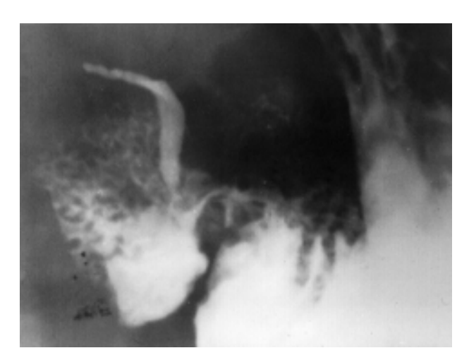
Figure 1. Barium meal study indicating deformed duodenal bulb and presence of barium in the common bile duct.

The patient was admitted again seven years later with