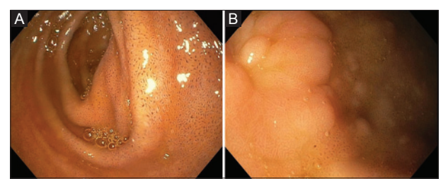
Figure 1 (A) Endoscopic image demonstrating multiple dark brown pigmented patches that did not change in shape, pattern, or color despite endoscopic water irrigation and suctioning. (B) Endoscopic image showing a polyp in the duodenal bulb