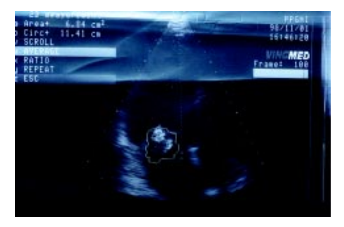
Figure 1. Echocardiogram showing dilation of the left ventricle with diffuse hypokinesia and a mural thrombus.

Chest X-ray showed increased cardiothoracic index with bilateral bronchoalveolar infiltrations and interstitial pneumonia (Figure 2). Arterial blood gazes were