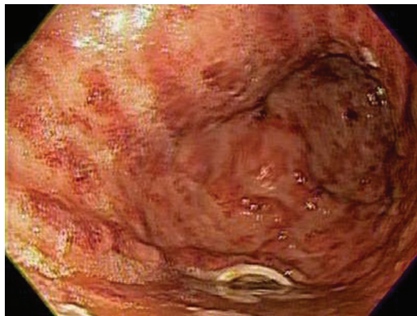
Figure 2 Severe gastritis 1 week after percutaneous endoscopic gastrostomy tube placement

Departments of a Medicine (Abhijeet Waghray); b Gastroenterology (Amy Michel-Calderon, Annette Kyprianou, Nisheet Waghray), MetroHealth Medical Center/Case Western Reserve University, Cleveland, OH, USA