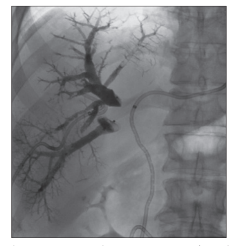
Figure 2 Fluoroscopic picture showing contrast cast after embolization of the right portal vein branches. A right external and a left internalexternal drain is also placed prior to surgical resection of the right liver lobe

particles or histoacryl glue [8] (Fig. 2). PVE and drainage may be performed in a sequential approach as a two-stage procedure or as recently published study by Guiu et al [9] during the same session.