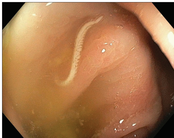
Figure 2 Trichuris trichiura in the cecum