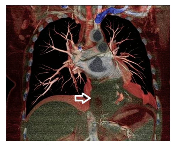
Figure 1 Coronal view of computed tomographic reconstruction showing the tumor in the left hemithorax (arrow indicates the tumor)

CK5/6, CK7; Ki67 index was 3-5%). Since discharge the patient remains free of symptoms.