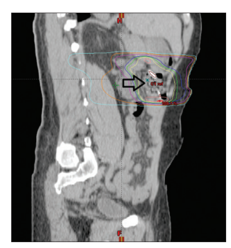
Figure 3 Radiation therapy planning; arrow shows endoscopically placed resolution clips as metallic densities on computed tomography

resolution clips (Boston Scientific, Massachusetts, USA) were endoscopically placed to mark the superior, inferior, lateral and medial extent of the tumor, in a "shooting target" fashion to facilitate in planned directed external beam RT (Fig. 1C) and to minimize the radius of toxic radiation exposure to the adjacent normal tissue (Fig. 3, arrow). Patient underwent uneventful RT with twenty targeted fractions and total radiation dose of 36 Gy without side effects or adverse events. Follow up colonoscopy with biopsy 6 months after RT showed no endoscopic or