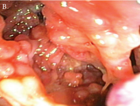
Figure 1 (A,B) Mucosal healing with diffuse pseudopolyps

Internal Medicine and Gastroenterology Unit, Complesso Integrato Columbus, Catholic University, Rome, Italy