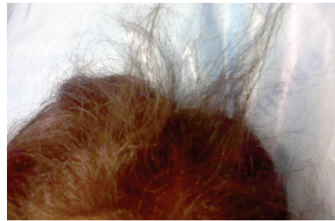
Figure 1 Patchy alopecia due to trichotillomania

Trichobezoar is the most common form of bezoars reported, with hairballs extending to the small intestine causing Rapunzel syndrome in a few cases. Trichophagia is equated to pica syndrome. Abdominal pain, anemia, and weight loss are the most common complaints. Evaluation involves ultrasonography, computed tomography and endoscopy. Endoscopic removal has been tried in few cases, however surgical elimination remains the preferred choice [2]. Treatment of trichotillomania is behavioral therapy. The importance and severity of trichotillomania should not be underrated and alertness of these disorders should be encouraged at primary health care level [3].