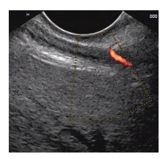
Figure 3 EUS: perforator vessel on power Doppler

Although immediate success rates of endoscopic botuli-