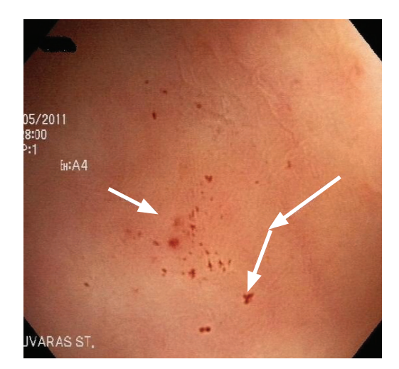
Figure 2 Angiokeratomas of colon