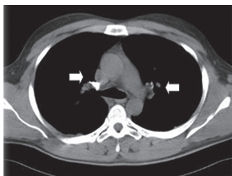
Figure 2 Pre-contrast agent infusion computed tomography scan. Hyperdense material evident in the right pulmonary artery and also in different segmental and subsegmental branches of both lungs