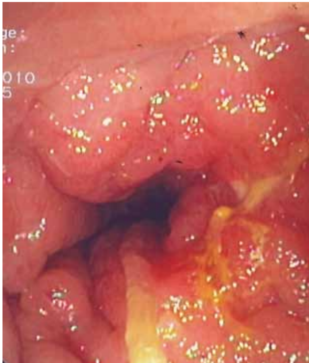
Figure 1 Endoscopic image showing circumferential narrowing of the rectal lumen, with intact overlying mucosa and cobblestone appearance

submucosa, whereas the other layers were normal (Fig. 2); an image compatible with “linitis plastica”. The patient underwent rectal extirpation and total cystectomy with lymph node dissection. Macroscopic examination of a sagittal section of resected rectum demonstrated an expanded submucosal layer due to infiltration with cancer cells, with intact mucosa and muscular layer (Fig. 3). Histological examination of the resected