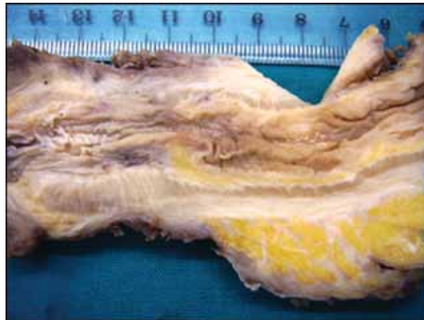
Figure 3 Macroscopic view of the resected specimen demonstrating an expanded submucosal space with intact mucosa and muscular layer

bladder showed a grade III papillary transitional cell carcinoma. In the rectum clusters of tumor cells of a poorly differentiated adenocarcinoma were observed. Immunostaining was positive for both CK7 and CK20; PSA was negative. Combining the cytokeratine profile histology and transrectal ultrasonography findings, the diagnosis of a primary urinary bladder tumor with hematogenous spread to rectal submucosal layer was established.