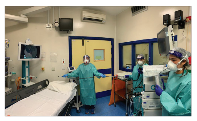
Figure 4 Setup of the endoscopy room during an anterograde doubleballoon enteroscopy at the Royal Free Hospital in London

recuperate the endoscopic activity canceled during the delay and the lockdown phases ranges from 103-155, depending on the PPE policy/perceived COVID-19 transmission risk, as described by Gupta et al [24]. We are also very likely to see a "domino