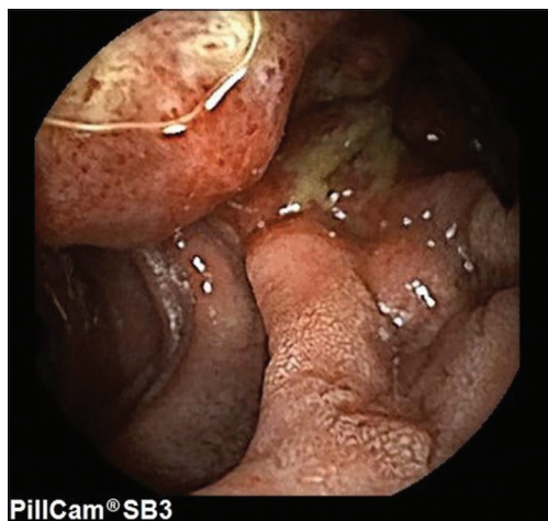
Figure 2 Enteropathy-associated T-cell lymphoma in a patient with refractory celiac disease

improvement in the extent of disease in 79% of patients following 6 months of GFD in a study by Murray et al [16]. A more recent study by Lidums et al showed an improvement in macroscopic villous atrophy in 12 patients with CD after 12 months of GFD [17]. We showed improvement in the extent of disease in a smaller group of patients with RCD following treatment with steroids and/or immunosuppressants in a previous study [19]. We have confirmed the same findings in this larger study carried out in 2 European centers. Interestingly, the same improvement noted in percentage extent of disease between the first and second SBCEs was not sustained during the third and subsequent SBCEs. This raises several questions about the effectiveness of current regimens used to treat patients with RCD and the timing interval between SBCEs. Even though the importance of repeating duodenal histology and SBCE in patients with RCD is recognized, no follow-up protocol has been proposed in the literature [13,32]. The poor prognosis of patients with RCD type II suggests that these patients should