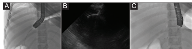
Figure 2 (A) Endoscopic ultrasound (EUS)-guided drainage using the forward-viewing echoendoscope: a guidewire was coiled inside the walled-off necrosis and the access site was dilated using 4-mm biliary balloon dilator. A 14-mm wide fully covered bi-flanged self-expanding metallic stent was deployed under EUS (B) and fluoroscopic (C) guidance

a newer echoendoscope that has a forward endoscopic view with a shorter and more flexible tip and is therefore easily maneuverable. It can be used instead of the oblique viewing echoendoscope in difficult anatomical situations [1].