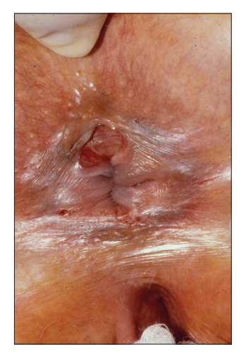
Figure 2 Chronic anal fissure with visible sphincter muscle at base of wound

The goal of medical treatment of anal fissures is to decrease the internal sphincter tone and allow healing. Topical nitrate use leads to healing of chronic anal fissures in about 50% of patients, and demonstrates a 13.5% improvement in healing over placebo [34]. Up to 50% of fissures healed with nitrates have recurrences [34]. The topical nitrates commonly used are isosorbide dinitrate and glyceryl trinitrate. Since the advent of topical calcium channel blockers, nitrates are not usually used in the treatment of anal fissures, because of the common sideeffect of headaches that occur in a dose-related manner [34,45]. A double-blind multicenter randomized trial comparing nifedipine gel to topical hydrocortisone and lidocaine found that the nifedipine treatment healed fissures within 21 days in 95% of patients, compared to 50% in the control treatment group [46]. Additionally, anal manometry confirmed that nifedipine decreased the resting anal pressure by 30%, whereas there was no change in the control group [46].