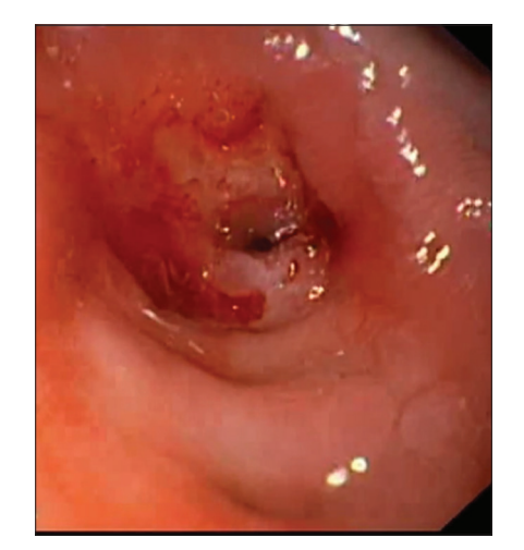
Figure 4 Gastric bypass: stenosis at gastrojejunal anastomosis