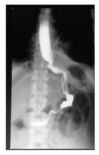
Figure 3 Sleeve gastrectomy: mid-gastric stenosis

lateral traction, with stapling leading to twisting of the gastric tube via a volvulus-like mechanism [25-27]. The site of stenosis is most often at the incisura angularis or gastroesophageal junction [26,28] (Fig. 3). When a stenosis occurs, it is usually one of two types: a functional one (passage of the endoscope is possible but the sleeve is twisted with various degrees of rotation, requiring the scope to be passed through the gastric lumen the so-called helix stenosis) or a mechanical one (when the passage of the endoscope is very difficult or impossible) [26]. Stricture and kinking may be avoided by keeping a safe distance between the incisura angularis and the edge where the staples are applied. In agreement with Manos et al , we believe that left-hand stapling offers the proper direction "to respect the incisura angularis " [26]. During left-hand stapling, the device will be parallel with the lesser curvature and not perpendicular,