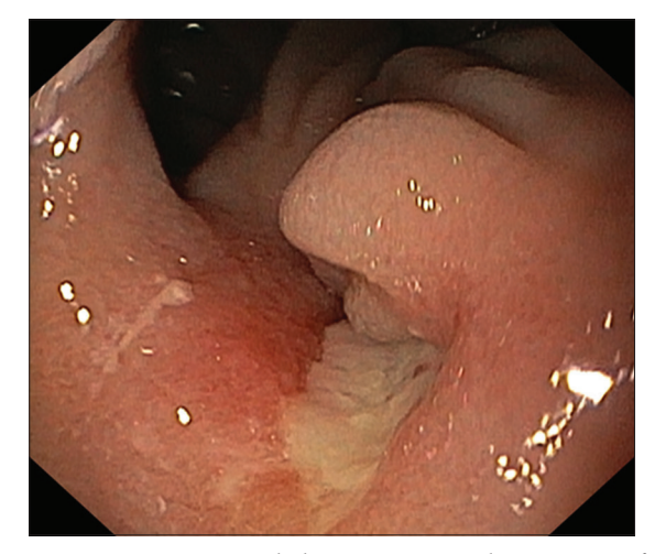
Figure 5 Recurrent marginal ulcer at gastrojejunal anastomosis after fibrin healing